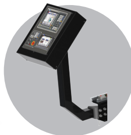
Sistema CNC Dedicado