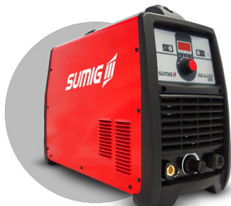
Real Cut I25 Font